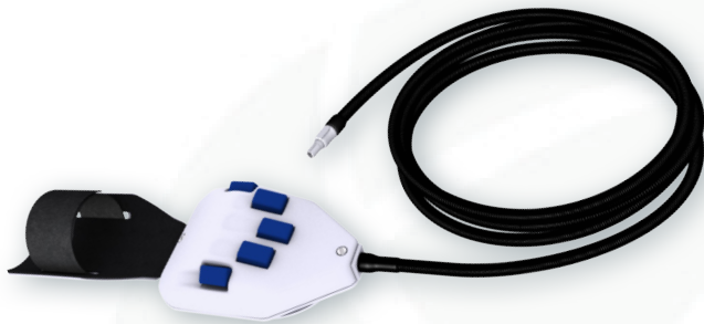
Celeritas Button Response Unit

Psychology Software Tools, Inc. has engineered the new Celeritas Optical Response System to accurately gather participant responses and verify signals – minimizing the chance of data loss. The new system can be customized to fit your research needs by selecting the combination of Button Response Units (BRUs) and Joysticks. The BRUs and Joysticks comfortably fit both small to large hand sizes and are constructed of entirely non-metallic components. The units communicate button presses through fiber optic cabling which connects to an Interface Console located in the control room through an available wave guide. The Interface Console provides real-time feedback of participant responses via LED indicators and includes a set of buttons that make responses for the participant as needed. The system seamlessly integrates with E-Prime® through a USB connection. The new Interface Console comes with an Optical Connector and a BNC Connector. These connectors allow the computer to accept either an optical or an electrical TTL pulse that the stimulus presentation computer interprets as another button press, allowing the user to synchronize their experiments with the MR scanner.