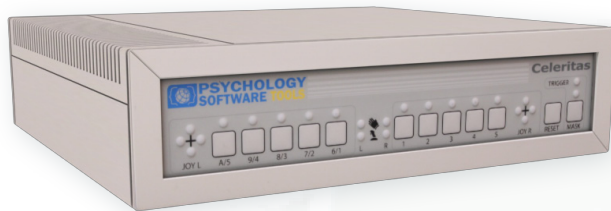
Fiber Optic Interface Console